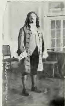
SCENES FROM THE MID-YEAR PLAY—MOLIERE'S "TARTUFFE"